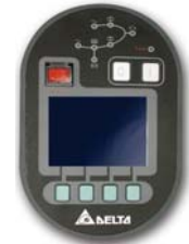
Control and LCD Display Panel

* When input voltage is 242 ~ 324/140 ~ 187 Vac, the sustainable loading is from 70% to 100% of the UPS capacity. All specifications are subject to change without prior notice.