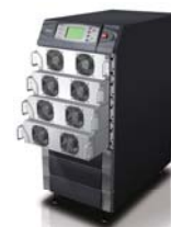
Up to 4 Modules in One Cabinet